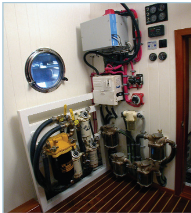
The utility room can be situated in place of the dinette shown in the rendering below.